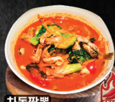
차돌짬뽕 SPICY BEEF BRISKET NOODLE SOUP

with beef brisket, clam, squid in spicy soup.