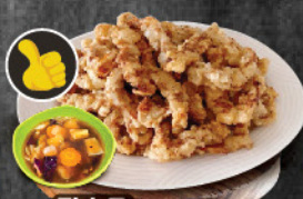
탕수육 FRIED SWEET N' SOUP PORK

crispy fried pork with sweet n' sour sauce.