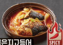
묵은지고들어 KIMCHI & MAKERAL

hard-boiled makeral with fermented kimchi.