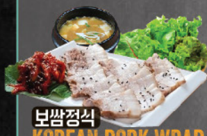
보쌈정식 KOREAN PORK WRAP

thin sliced braised pork belly with radish kimchi, leafy vegetable for wrap.