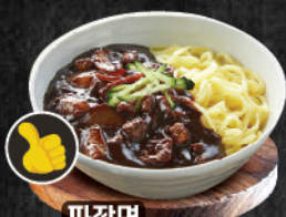
짜장면 BLACK BEAN NOODLE

white noodle, diced pork, onion, cabbage in black bean sauce.