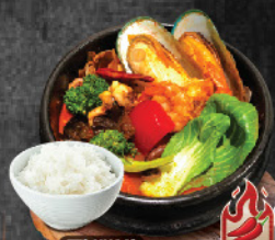
짬뽕밥 SPICY SEAFOOD SOUP WITH RICE

seafood, vegetable in spicy soup with rice.