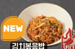
김치볶음밥 KIMCHI FRIED RICE