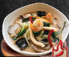
나가사키짬뽕 NAGASAKI SEAFOOD NOODLE SOUP

with mussels, prawn, webfoot octopus, squid, clam in white mild soup.