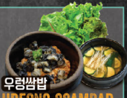
우렁쌈밥 UREONG SSAMBAP

freshwater snail on thickened soybean paste with leafy vegetable.