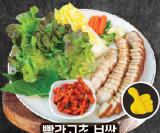
빨간고추 보쌈 BOSSAM (KOREAN PORK WRAP)

thin sliced braised pork belly with pickled cabbage leaf, green lettuce.