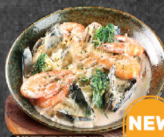
해물크림짬뽕 CREAMY SEAFOOD NOODLE SOUP

with mussels, prawn, webfoot octopus, squid, clam in creamy soup.