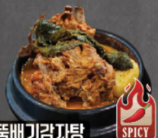
독배기감자탕 SPICY PORK BONE SOUP