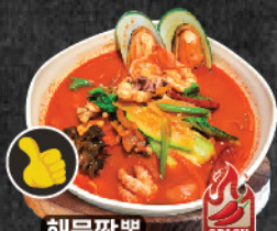
해물짬뽕 SPICY SEAFOOD NOODLE SOUP

mussels, prawn, webfoot octopus, squid, clam in spicy soup.