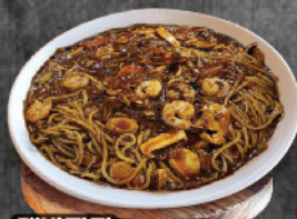
쟁반짜장 BLACK BEAN NOODLE ON A JUMBO PLATE

MON - FRI, 11:00am - 03:00pm (Not Avail. on Public Holidays)