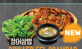
장어쌈밥 GRILLED EEL SSAMBAP

(WITH SOYBEAN PASTE STEW) grilled eel with assorted leafy vegetable wrap&rice.